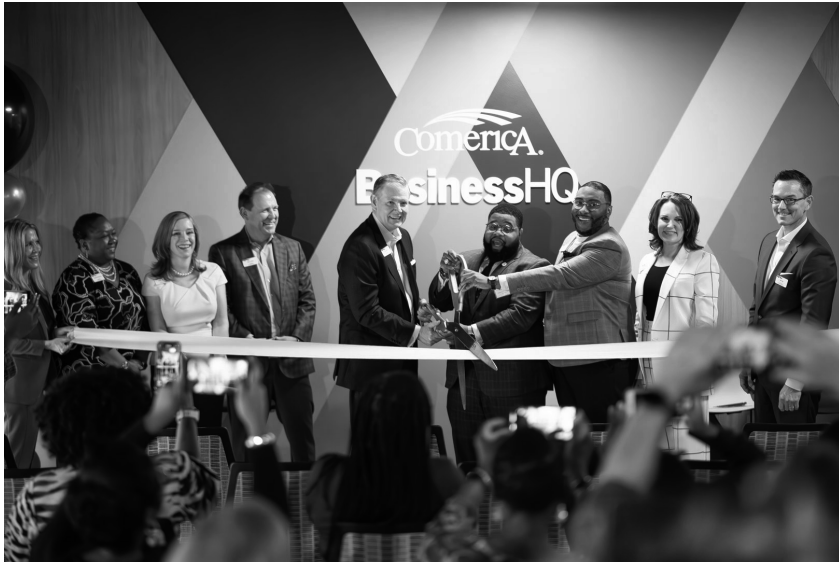
Comerica executives join representatives from the Dallas Black Chamber of Commerce during the official ribbon cutting ceremony of Comerica BusinessHQ. The new state-of-the-art facility serves as a collaborative space providing integral services to small businesses in the Southern sector of Dallas.

The Small Business Banking team leads our support for small business clients and remains dedicated to meeting unmet customer needs, serving our communities and driving growth. This team supports 80% of banking centers across all markets and reaches