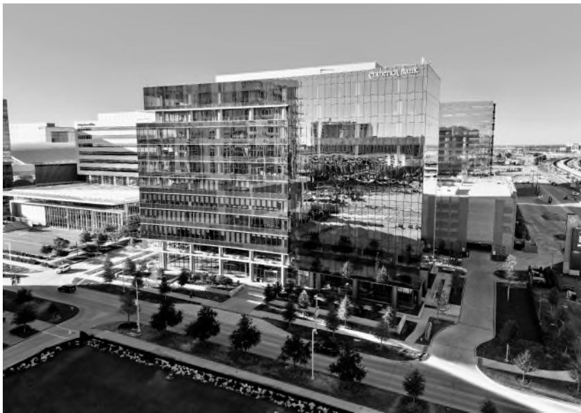
Comerica officially opened the doors to its new Business & Innovation Hub in Frisco, Texas. The office houses approximately 300 colleagues from a variety of teams, including technology and product management to front-line business units.