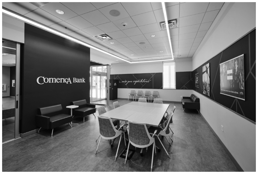
In 2023, Comerica introduced Comerica CoWorkSpaces™ as part of its latest services tailored for small business customers. These spaces provide Comerica small business customers with free access to office and meeting space.

The Small Business Banking team leads our support for small business clients and remains dedicated to meeting unmet customer needs, serving our communities and driving growth. This team supports 80% of banking centers across all markets and reaches