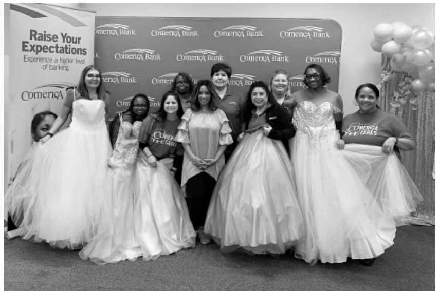
Comerica colleagues volunteer to help sort dresses as part of the fifth annual Metro Detroit Prom Dress Drive supporting Jackets for Jobs. In 2023, Comerica volunteers served their local communities by amassing more than 79,000 volunteer hours.

As a leader in the financial services industry, we understand and value the importance of clear and understandable public disclosure. Ensuring our transparency of these important measures, the Corporate Responsibility division issued its 15th annual Corporate Responsibility Report and, for the second year, published the Task Force on Climate-Related Financial Disclosures (TCFD) Report that included, for the first time, our disclosure of financed emissions.