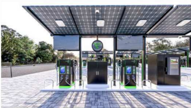
EVII charging hub

By getting in early on this cutting-edge charging hub and co-ownership model, investors can support sustainable EV adoption while potentially earning outstanding financial returns.