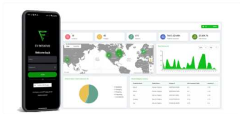
The EV Initiative point-of-sale and Charging Management Solution

EVII Mission Hills' primary revenue generation activity is refueling EV drivers, as the site is open to the public 24/7. The EV Chargers live and operate on the EV Initiative Charging Network and revenues are generated from the margins on electricity and/or the service of charging a drivers car.