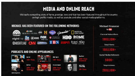
$0 marketing, with the potential to reach 1 billion views. Michael Franzese has a