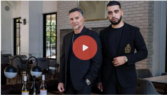
franzesewine.com Rossville CA