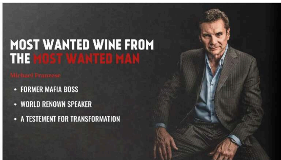
2nd biggest money maker in Mobs History after Al Capone. Michael Franzese turned his life around after finding God in Solitary Confinement. Now he shares the story of redemption and transformation across the world.