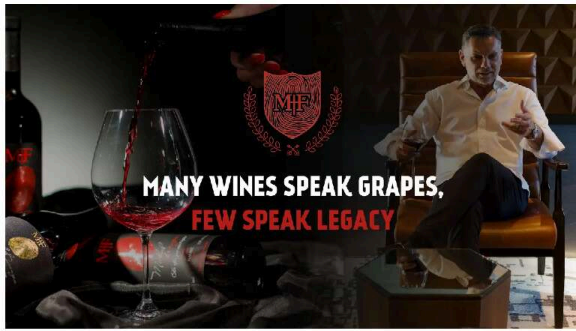
USA Today "Billion Dollar Wine Brand"