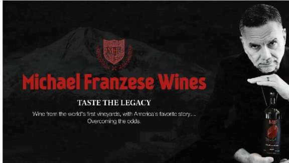
A Blend of Legacies