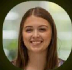
Chief Of Staff