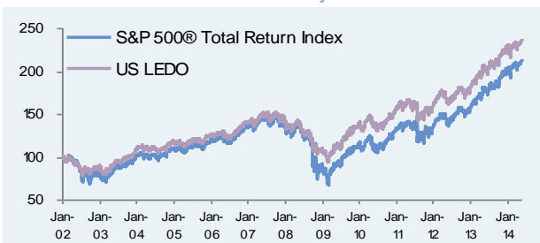
Hypothetical historical performance comparison: US LEDO and S&P 500® Total Return Index: Jan 2002 – May 2014

As of 5/30/2014. PAST PERFORMANCE AND BACK-TESTED PERFORMANCE ARE NOT INDICATIVE OF FUTURE RESULTS. The Index was launched on 9/17/2013; therefore any data shown for the Index prior to that date is back-tested. The information in this chart is provided solely for reference. No guarantee can be given that the Index will outperform the S&P 500® Total Return Index or will not under perform the S&P 500® Total Return Index in the future.