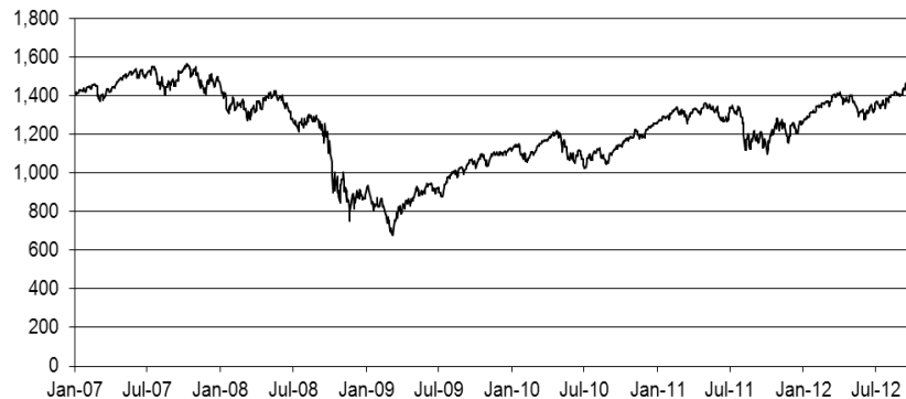
S&P 500® Historical Performance – Daily Index Closing Values January 2, 2007 to October 10, 2012

License Agreement between Standard & Poor's and J.P. Morgan Securities LLC "Standard & Poor's®," "S&P®," "S&P 500®" and "Standard & Poor's 500" are trademarks of Standard & Poor's. and have been licensed for use by J.P. Morgan Securities LLC. See "The S&P 500® Index — License Agreement with S&P" in the accompanying product supplement no. MS-1-I.