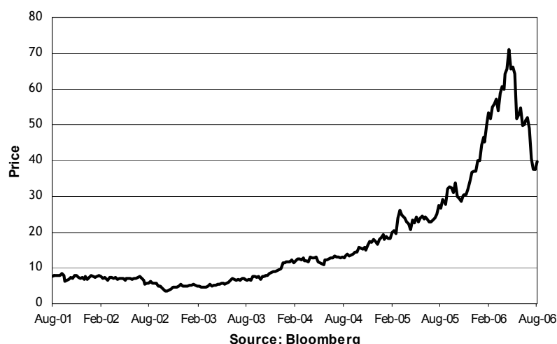
Historical Performance of Joy Global