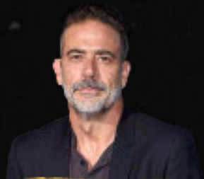
JEFFREY DEAN MORGAN