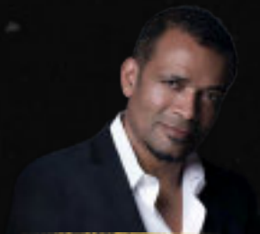
MARIO VAN PEEBLES