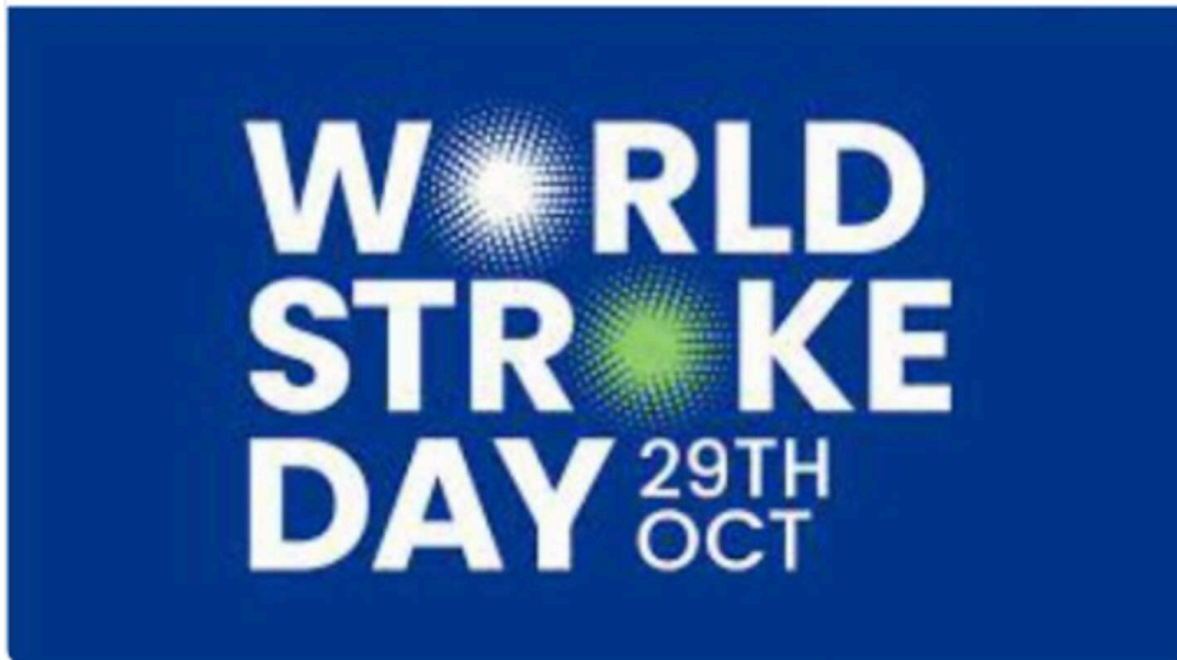
LinkedIn Post 2:

It's World Stroke Day. Let's change this and make it history. We are developing a drug to fight heart attack an stroke and you can now be part of this. Go to Wefunder.com/Corvidane and learn more about how you can invest and grow with our success.