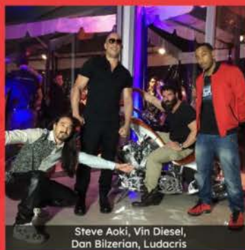
Steve Aoki, Vin Diesel, Dan Bilzerian, Ludacris