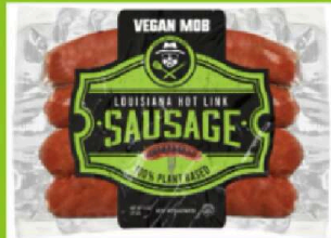
Launching Plant Based Meats