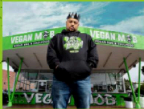
3 Locations - OAK, LA, LV