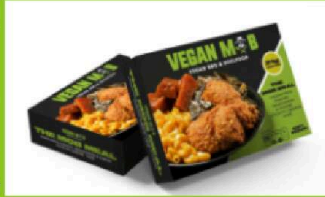
CPG Model - Frozen Dinners