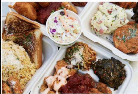
Some of the delicious meals at the Vegan Mob — Photo courtesy of Toni Zerkis and Maya Cameron-Gordon

Located in Oakland, California, Vegan Mob serves vegan BBQ and soul food. One of their much-loved dishes is the "barbequito" which is a tortilla that's stuffed with vegan brisket, Mob sauce, macaroni, barbecue baked beans, slaw and guacamole. The barbecue seasoned fries are also a big hit.