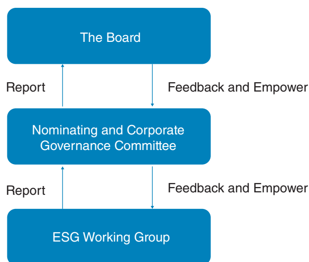
Zhihu ESG Management Structure

Zhihu continuously strengthens its ESG management capabilities by establishing an ESG management structure and forming a regular mechanism for ESG management and fulfilment, integrating the concept of sustainable development into corporate strategies and implementing them. We have formed a three-tier ESG management structure, including the Board, the Nominating and Corporate Governance Committee, and the ESG Working Group composed of various functional departments, with specific responsibilities as follows.