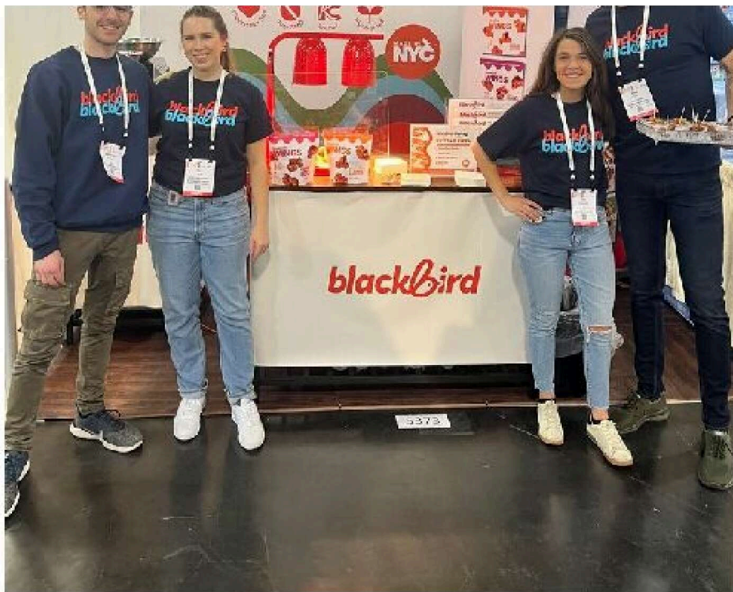
The Blackbird Team at Expo West 2023