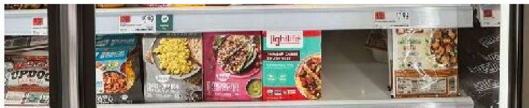
Blackbird on the shelf in Whole Foods featured as a local brand

Blackbird Foods is "testing the waters" to gauge investor interest in an offering under Regulation Crowdfunding. No money or other consideration is being solicited. If sent, it will not be accepted. No offer to buy securities will be accepted. No part of the purchase price will be received until a Form C is filed and only through Wefunder's platform. Any indication of interest involves no obligation or commitment of any kind.