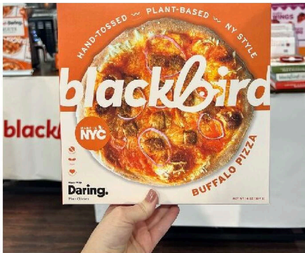
Sampling our Blackbird x Daring Pizza for the first time ever at Expo West 2023