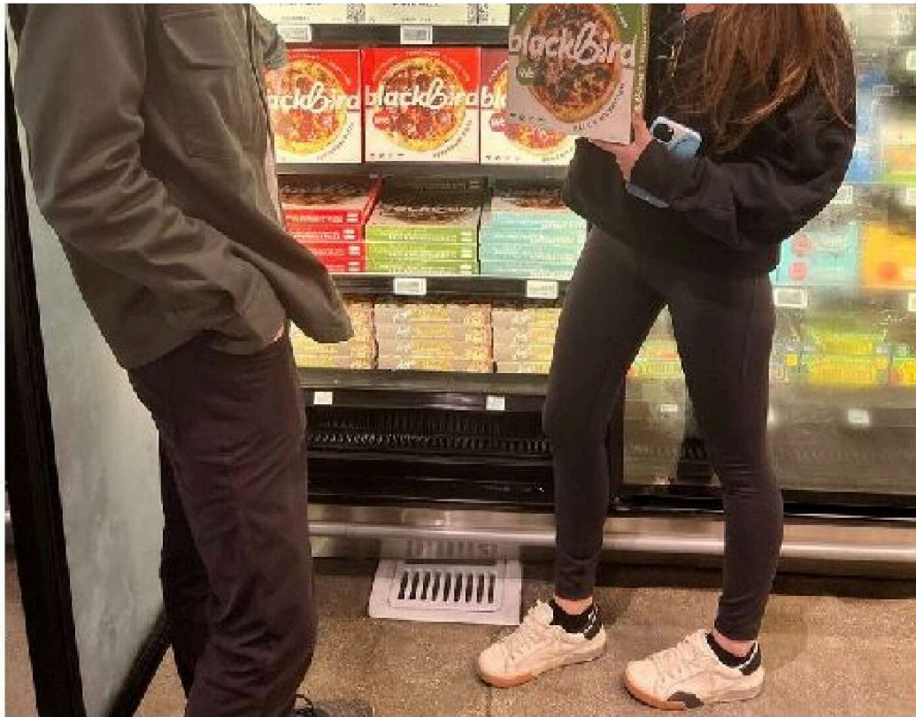
Blackbird on the shelf in Erewhon

Blackbird Foods is "testing the waters" to gauge investor interest in an offering under Regulation Crowdfunding. No money or other consideration is being solicited. If sent, it will not be accepted. No offer to buy securities will be accepted. No part of the purchase price will be received until a Form C is filed and only through Wefunder's platform. Any indication of interest involves no obligation or commitment of any kind.