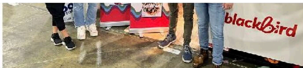
The Blackbird Team at Expo East 2022