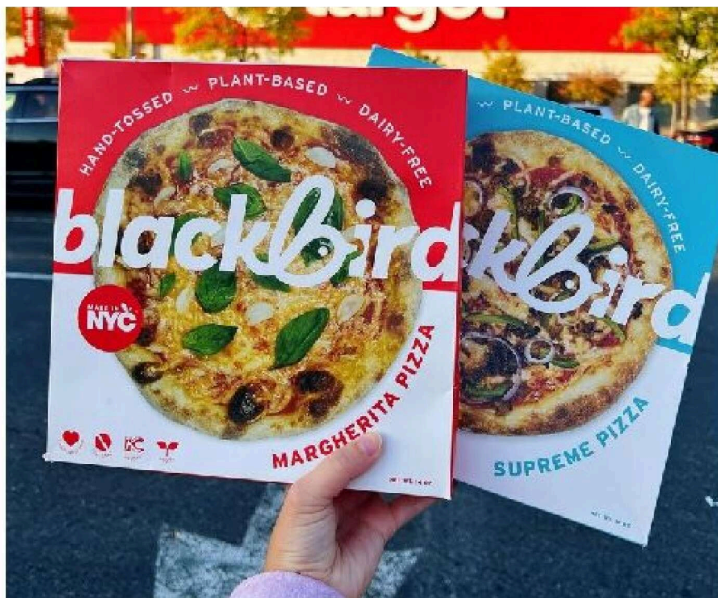
Our Margherita and Supreme Pizzas recently launched in 307 Target stores nationwide