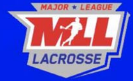
Major League Lacrosse