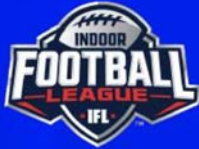
Indoor Football League (IFL)