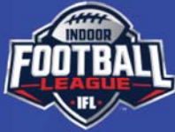
Indoor Football League (IFL)