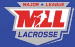
Major League Lacrosse