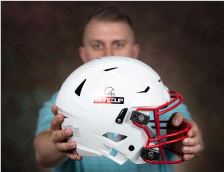
Cedarville SAFEClip Ceadrville University PR Feature