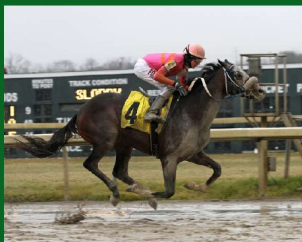
Max Player (Honor Code – Fools in Love)

Annestes Thoroughbreds owns an interest in: