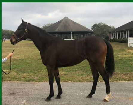
Swingman (Tonalist – Eternal Grace)