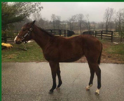
Unnamed Filly (Munnings – Indy Anesthesia)