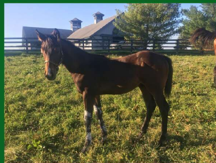
Unnamed Colt (Midnight Lute – Indy Anesthesia)