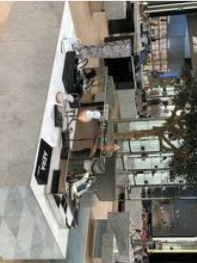
AERA in Bloomingdale's Dubai

We plan for 20% of our sales to come from wholesale, either to brick & mortar or online retailers. To date we've had discussions with retailers such as Nordstrom, Farfetch and Net a Porter. In addition, we are considering international wholesale partnerships as well. In February 2020, we delivered 243 pairs to Bloomingdale's Dubai and Ounassae in the Middle East. Our CEO's strong international expansion experience and network guarantees our international potential.