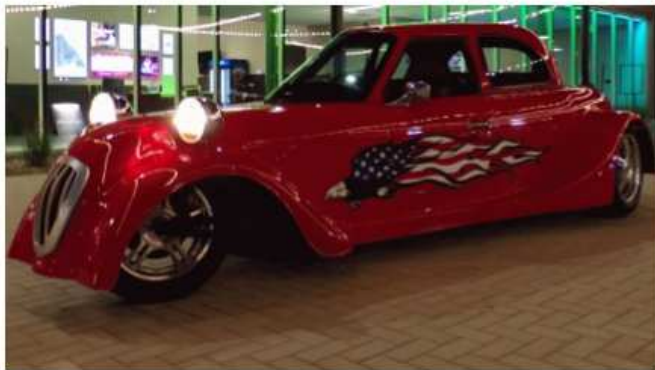
Defiant EV 3 Roadster™

Please refer to the financial statements in this Annual Report. A subsequent section in this document provides the principal executive officer's certification of the financial statements.