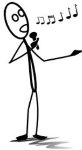
Artists & Record Labels

The world's first record label co-owned by music fans, where their ownership allows for participation in artist discovery, promotion, and the opportunity to share in its financial success.