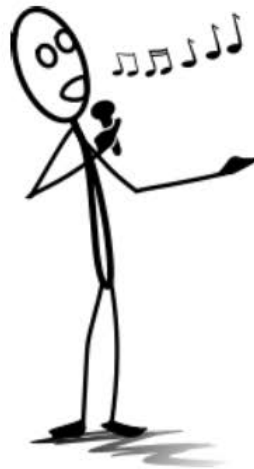
Artists & Record Labels

The world's first record label co-owned by music fans, where their ownership allows for participation in artist discovery, promotion, and the opportunity to share in its financial success.