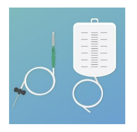
on catheters & implants