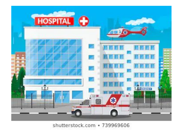
on walls & other surfaces in numerous types of healthcare settings