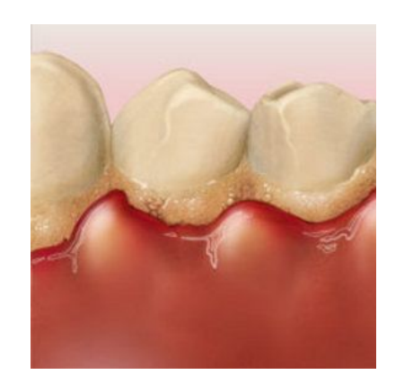
as dental plaque

Bacterial biofilm forms when individual bacteria are allowed to colonize on a substrate. These bacteria form a complex matrix of millions of cells and are present everyday in the products we use, surfaces we touch, and our own bodies and health: