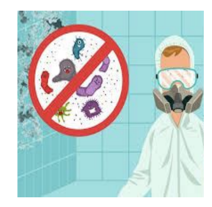
in bathrooms, drains & piping