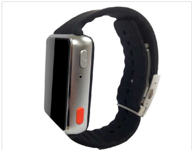
The 2nd Gen Sensor Watch & A Phone.