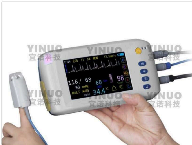
Handheld Tricorder at HIMSS in Las Vegas