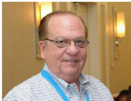
John A. Perez