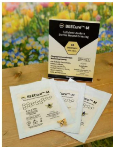
Advanced Wound Care (AWC)

The advanced wound care MGO dressing is currently in the testing phase, and being tested by the U.S. Air Force. The radiodermatitis cream is in the testing phase for the product and packaging. All other products have not yet been created.