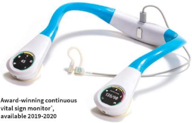
Award-winning continuous vital sign monitor*, available 2019-2020

Our platform meets the needs of patients, providers and payers. We are delivering telehealth and remote patient monitoring services to health insurers, health systems, hospital systems, ACOs, SNFs, nursing homes and physician practices across the country. Cloud DX Connected Health data, secured with 256-bit encryption, is fully HIPAA compliant.