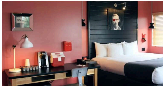
LGBTQ Hotel Gaythering Miami

pricing, A/B testing, algorithm tweaks etc.). We also added a social layer on the LGBTQ friendly hotel service allowing our guests and hosts to connect and discover who will be staying in the same hotel/city to explore the city together. It was a 6 month technical project. Then we kicked off marketing. By the end of Q1, we were growing bookings 20% month over month, until the global pandemic hit.