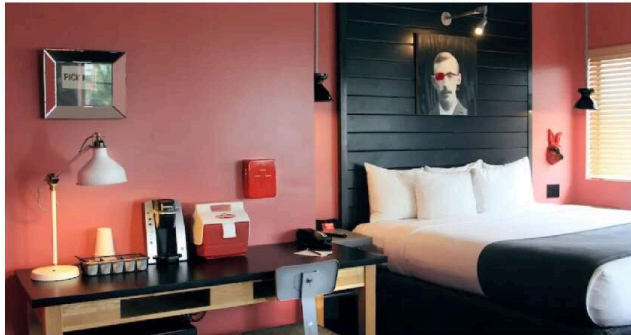
LGBTQ Hotel Gaythering Miami

After closing our Wefunder round, everything accelerated. We hired developers to work on implementing our LGBQ hotel offering. This was a big challenge due to complexity of this type of business (API for live calls on availability and pricing, A/B testing, algorithm tweaks etc.). We also added a social layer on the LGBTQ friendly hotel service allowing our guests and hosts to connect and discover who will be staying in the same hotel/city to explore the city together. It was a 6 month technical project. Then we kicked off marketing. By the end of Q1, we were growing bookings 20% month over month, until the global pandemic hit.