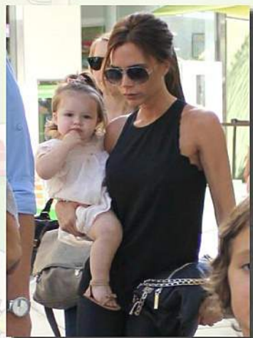
Victoria Beckham and Harper at Giggles N' Hugs