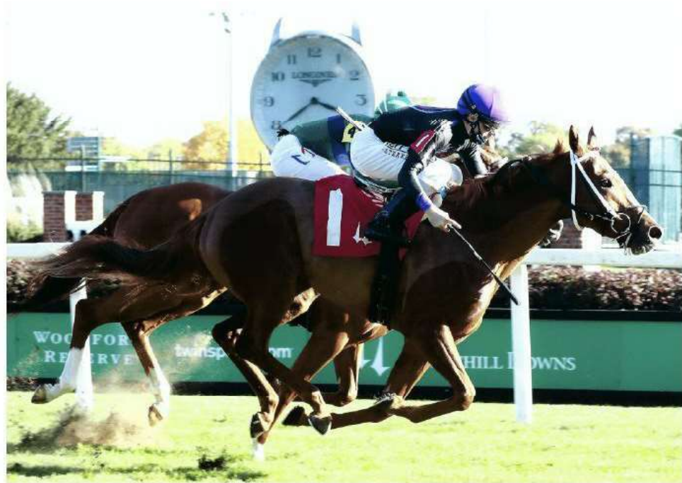
Pictured above Margaret's Joy, winning 1st place at Churchill Downs in November 2020.