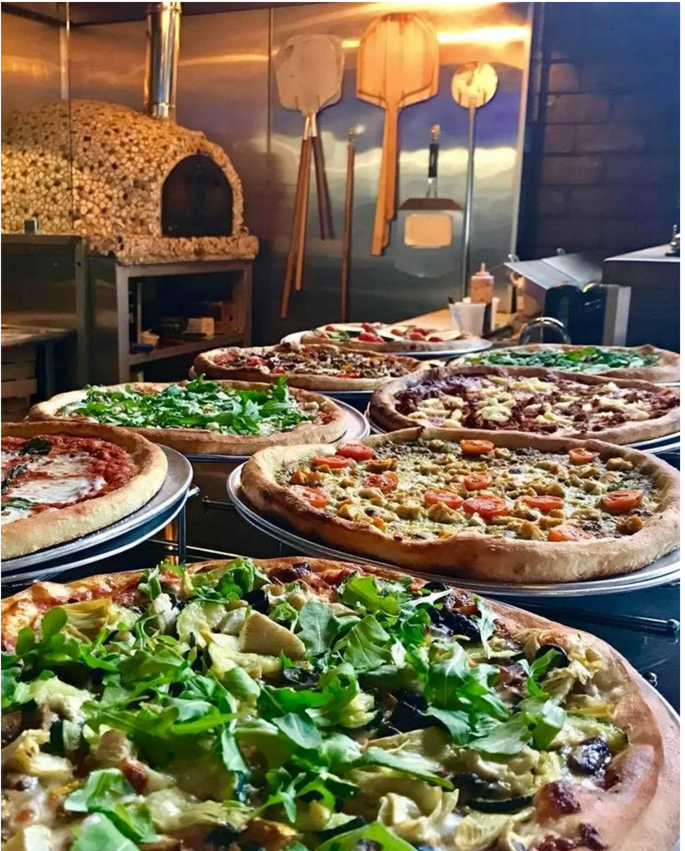
( https://cdn.nextseed.co/app/uploads/on-the-kirb-pizza-2.jpg )