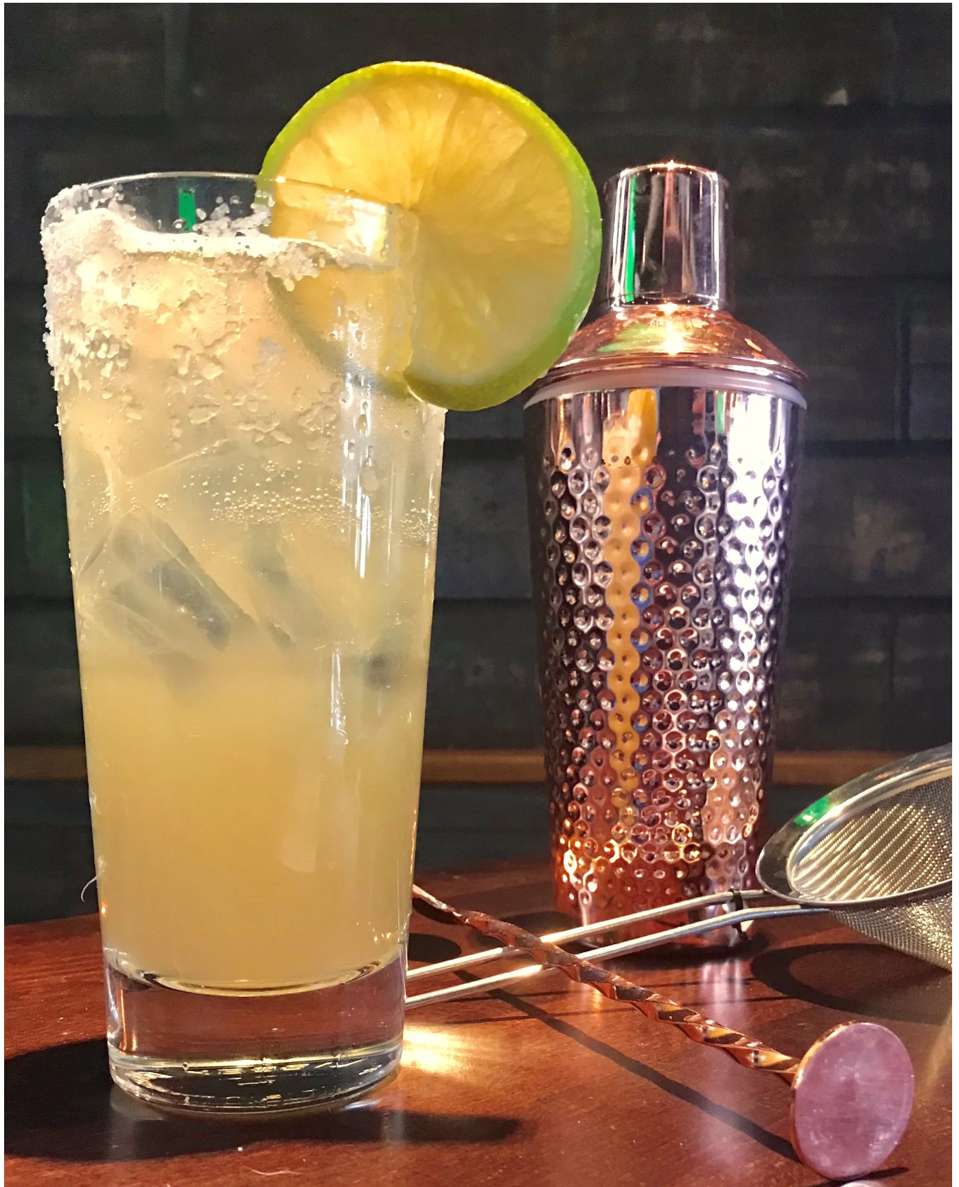
( https://cdn.nextseed.co/app/uploads/pb-drink-2.jpeg )