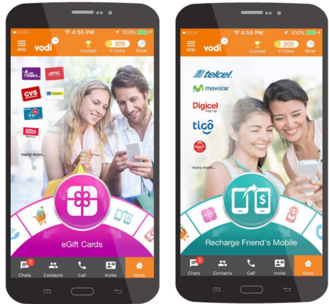
Vodi's eGift card store offers more than 80 brands (left). Recharging your loved ones' mobiles around the world is simple, quick and convenient (right).

Not only does Vodi make it easy to socially give to one another, but the app also gives back to its users every day. Earning rewards is easy and fun with Vodi's engaging, community-based gamification format. Users earn an "in-app" currency called V-Coins, which can be