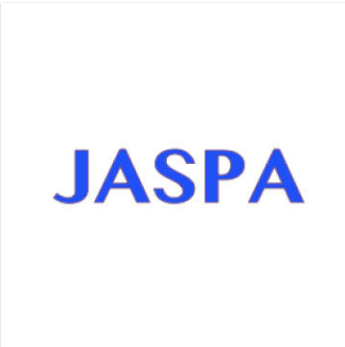
Jaspa Associates LLC Investor, 2 Rounds of Investment in Logic Products

Q: Why do Amazon fees vary between 20%-50%? Logic Products: Depending on the category that the product is classified in that affects Amazon's fees. Since we are selling in four categories (household, pet, beauty, home & kitchen), there are variations in the fees. Q: Can you also explain why the Amazon fees appear to be increasing YoY? Logic Products: Amazon has been increasing rates for all vendors over the years.