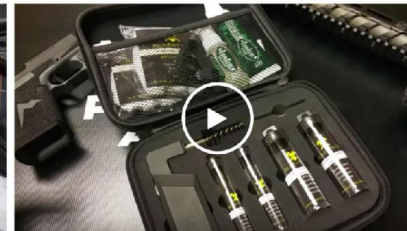
The Full Kit

This reviewer breaks down the entire Blazntech package.