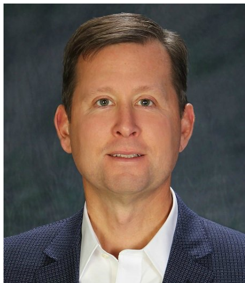
Incoming Executive Vice President and Chief Financial Officer