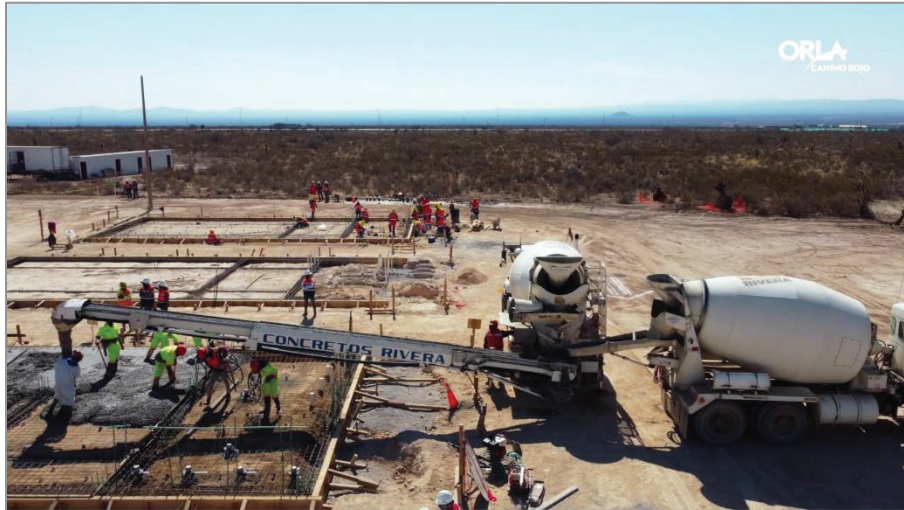
Figure 3: Preparation of Camp Area