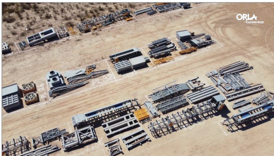
Figure 4: Process Plant Equipment Delivery and Laydown