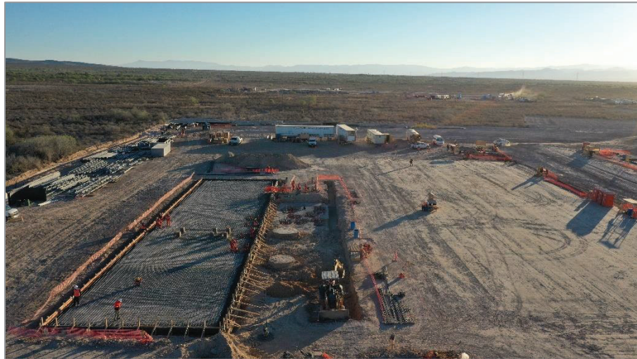
Figure 2: Preparation of Merrill Crowe Plant Area