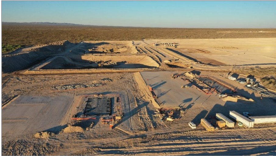
Figure 1: Excavation of Process Ponds and Preparation of Heap Leach Pad