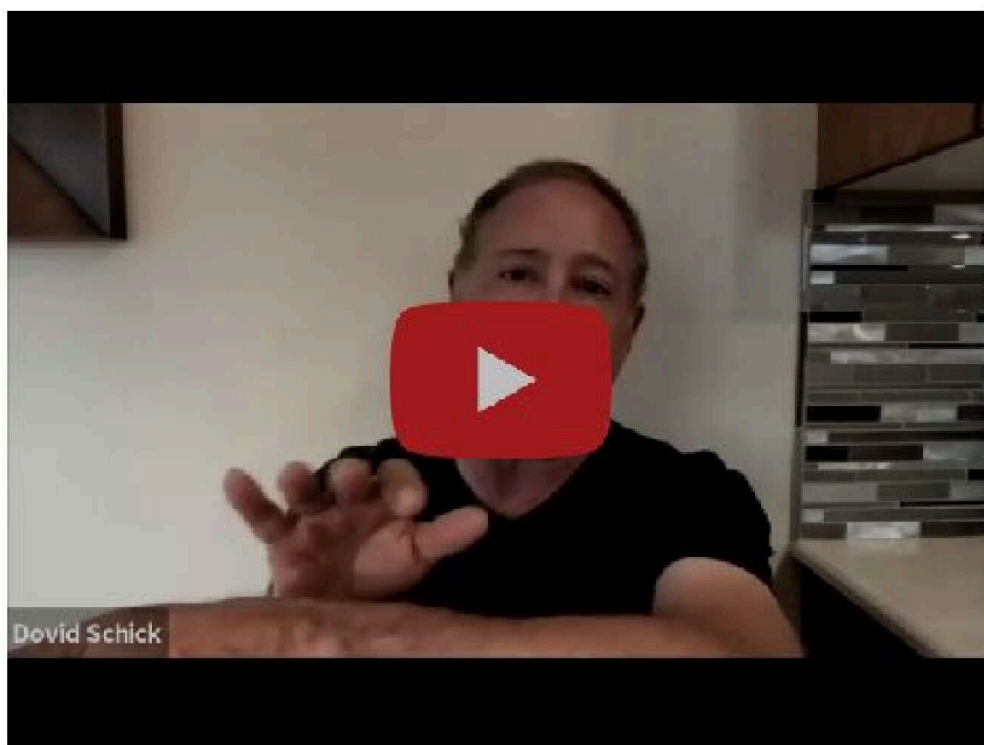
Why Tap in the Key to AR

Here is a recording of the conversation: