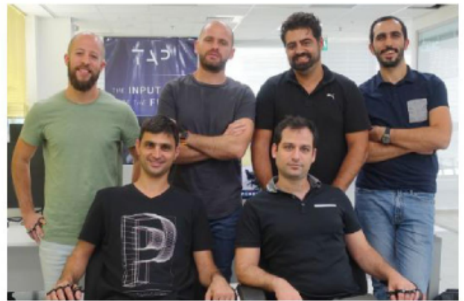
The Tap Development Team