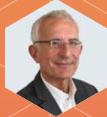
Guillaume Pepy Director