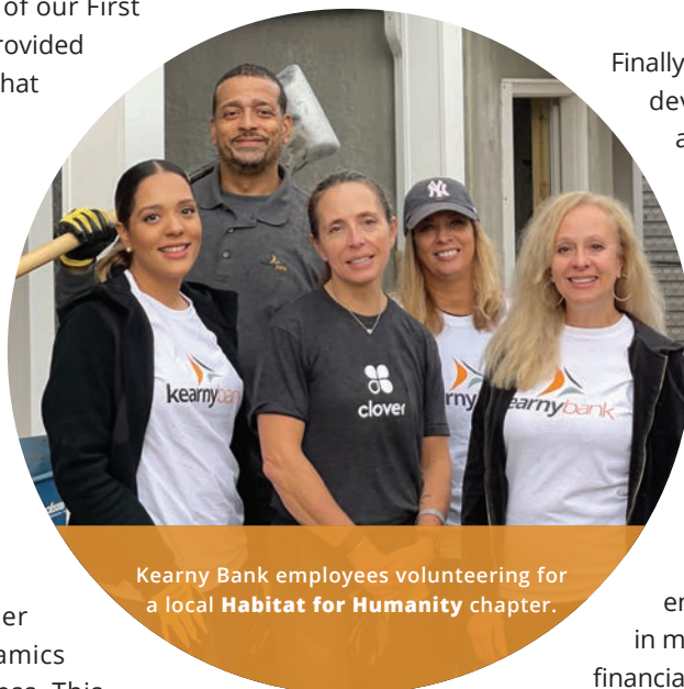
Kearny Bank employees volunteering for a local Habitat for Humanity chapter.

climate change. To better quantify these risks, we conduct an annual climate risk analysis. The analysis reviews the various risks posed to our retail branch network, regional corporate headquarters and loan portfolio as measured by the Federal Emergency Management Agency National Risk Index. Overall, our business continues to be exposed to only low to moderate risk of natural disaster. During 2023, we implemented an energy management system to monitor and reduce energy usage in our regional corporate headquarters. Transitioning to paperless processes utilizing digital technology is another way to help reduce our overall reliance on paper resources. Lastly, the move to more cloud-based technologies to reduce on-premises power consumption by our electronic equipment should continue to evolve over the coming years.