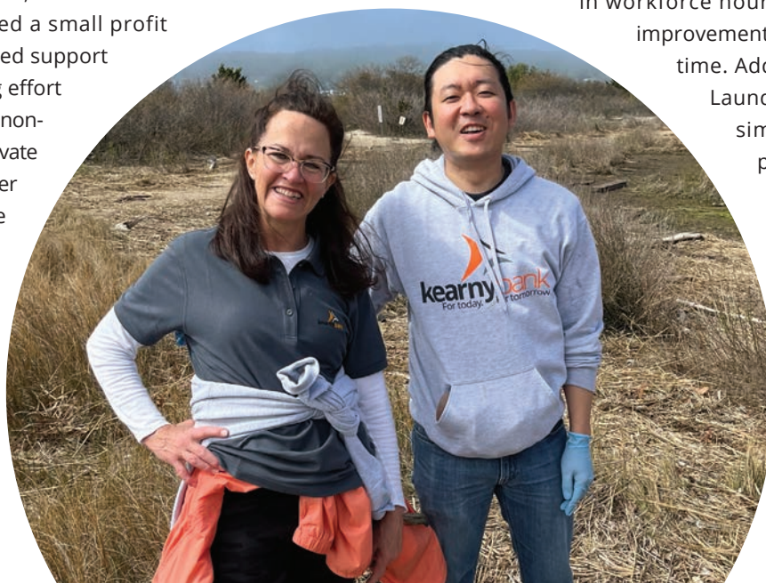
Kearny Bank donated $5,000 in support of Beach Sweeps , while employee volunteers — including those representing some of the bank's 13 Jersey Shore-area locations — participated in the cleanup at Sandy Hook.

As a part of our ongoing capital management plan, we purchased 2,820,398 shares of our common stock at a cost of $27.4 million or $9.73 per diluted share during this fiscal year. Finally, our special assets team worked diligently this year, as the balance of our non-performing assets decreased by $36.6 million or 39.7% to $55.6 million, or 0.69% of total assets from $92.2 million, or 1.19% of total assets in fiscal year 2022. This was accomplished while maintaining an average annualized charge-off ratio of 0.01% for fiscal 2023 as compared to 0.07% for fiscal 2022. Historically, we have maintained a charge-off ratio of approximately 3 basis points on average over the last five years, which is one of the lowest ratios in the community bank sector.