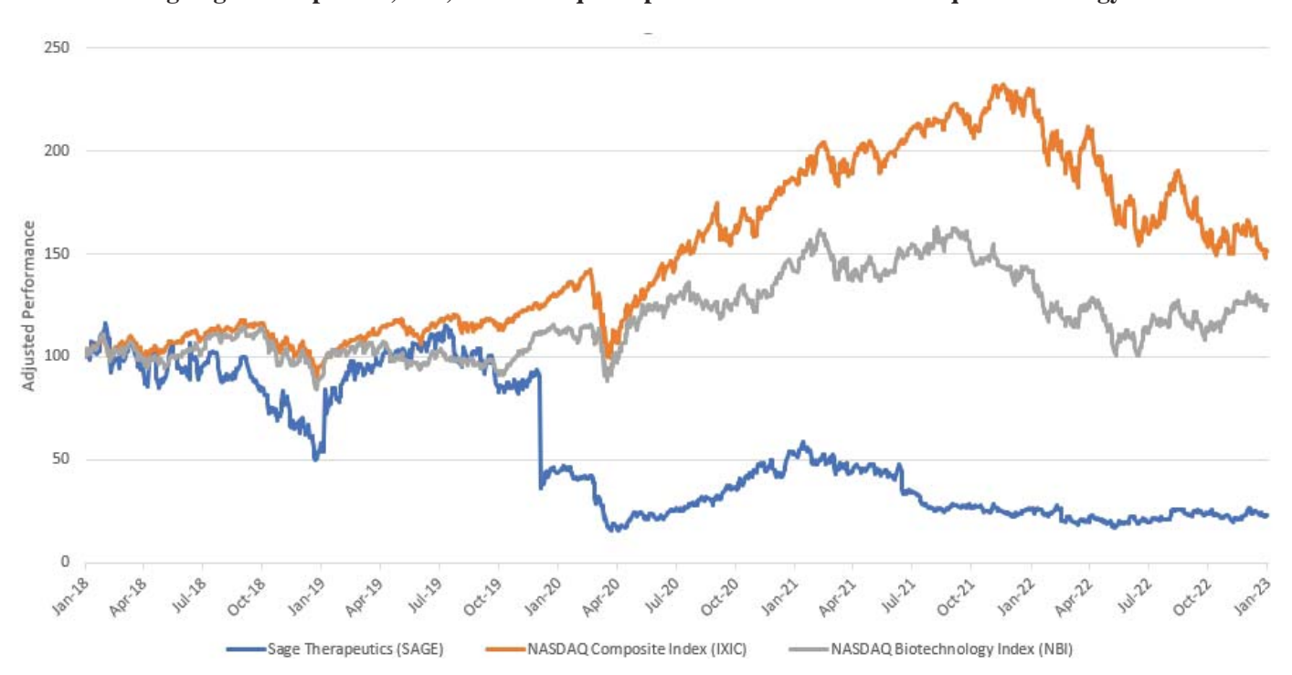
Comparison of Cumulative Total Return* Among Sage Therapeutics, Inc., the Nasdaq Composite Index and the Nasdaq Biotechnology Index

The following graph illustrates a comparison of the total cumulative stockholder return for our common stock since January 1, 2018 through December 31, 2022, to two indices: the Nasdaq Composite Index and the Nasdaq Biotechnology Index. The graph assumes an initial investment of $100 on December 31, 2017 in our common stock, the stocks comprising the Nasdaq Composite Index, and the stocks comprising the Nasdaq Biotechnology Index. Historical stockholder return is not necessarily indicative of the performance to be expected for any future periods.