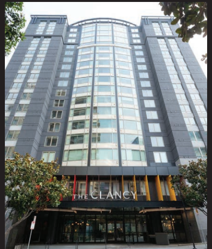
The Clancy San Francisco, CA