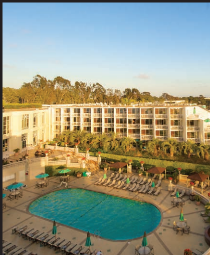
Hilton La Jolla Torrey Pines La Jolla, CA