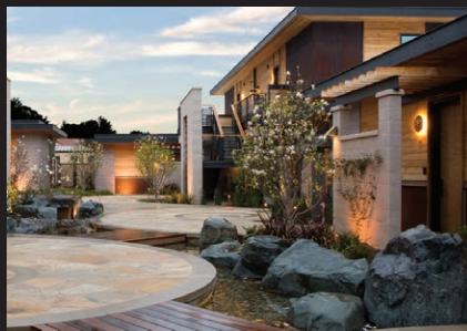
Bardessono Hotel and Spa Yountville, CA