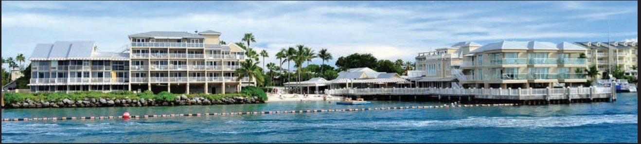
Pier House Resort Key West, FL