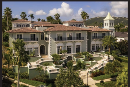
The Ritz-Carlton St. Thomas St. Thomas, USVI