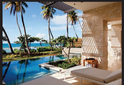
The Ritz-Carlton Reserve Dorado Beach Dorado, Puerto Rico