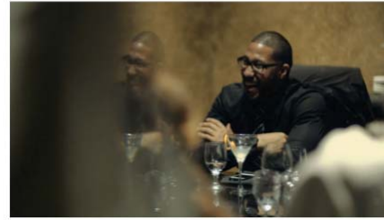
Of their own brand and their own company.