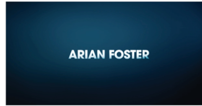
Title: Arian Foster