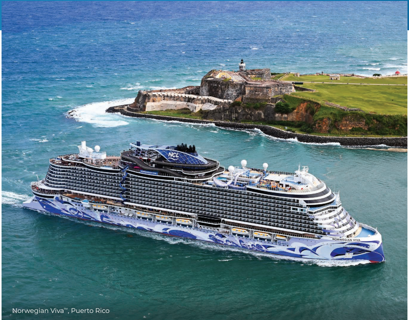
Norwegian Viva™, Puerto Rico