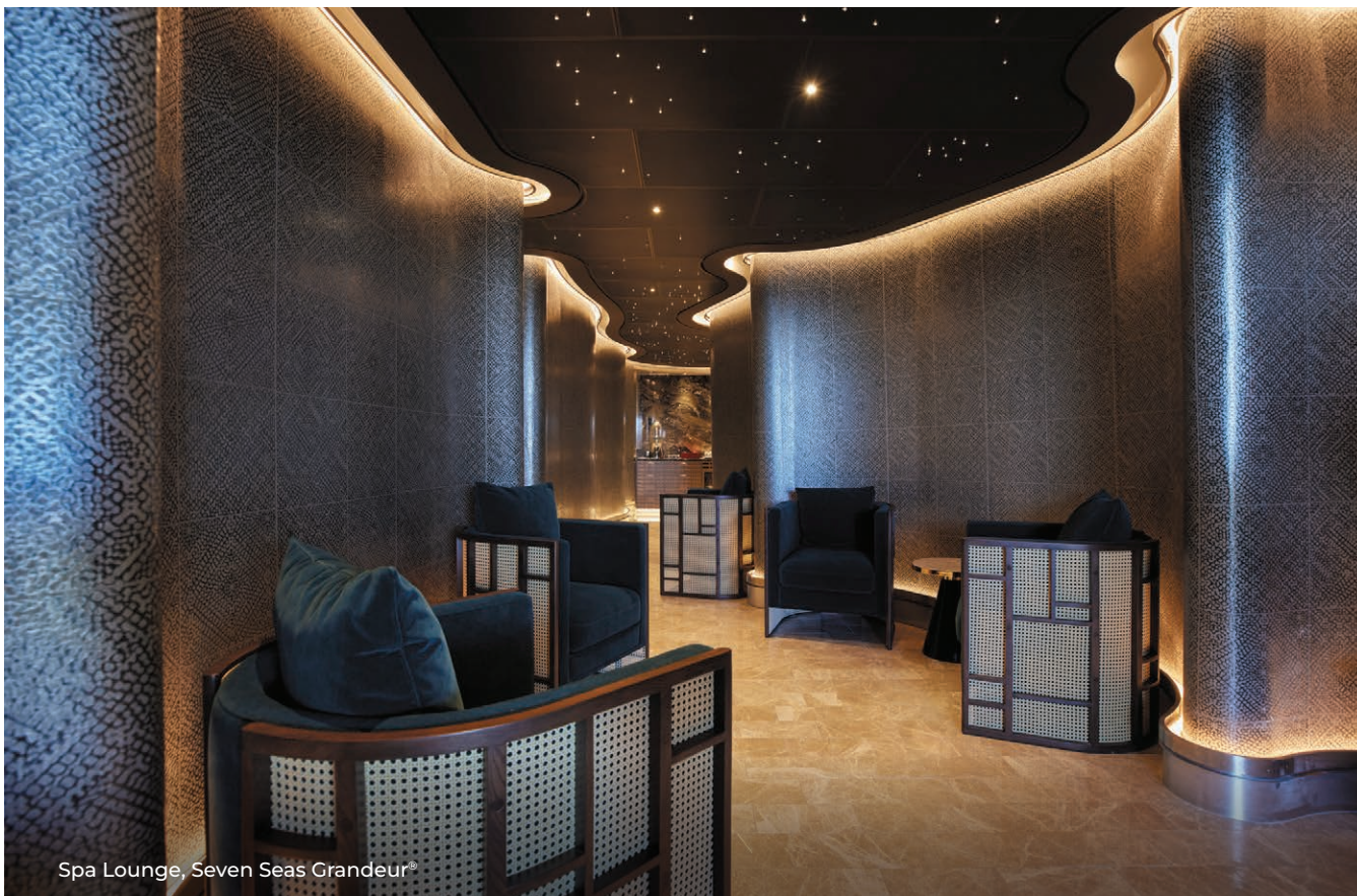
Spa Lounge, Seven Seas Grandeur®

Norwegian Cruise Line introduced Beetlejuice: The Musical as the headline production on its innovative new ship, Norwegian Viva. This marked the first time the Tony Award®-nominated musical was performed at sea. The 90-minute Broadway adaptation of Tim Burton's iconic 1988 film tells the story of the Deetz family as they attempt to remodel a hilariously haunted house. The musical's supernatural elements are enhanced by Norwegian Viva's three-story multi-purpose Viva Theater & Club, featuring immersive special effects, cutting-edge lighting and audio technology.