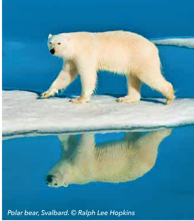
Polar bear, Svalbard.