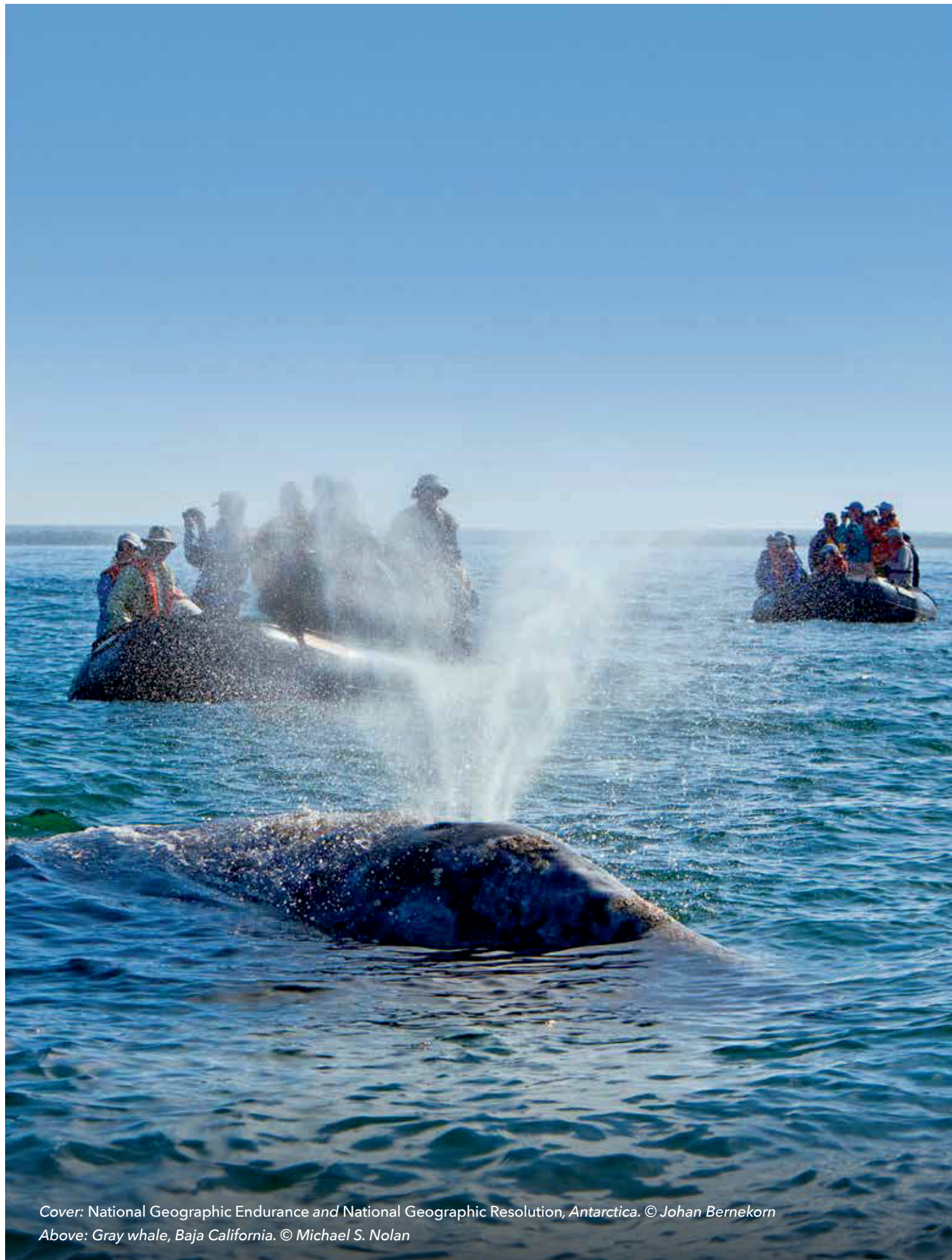
Cover: National Geographic Endurance and National Geographic Resolution, Antarctica. Above: Gray whale, Baja California.