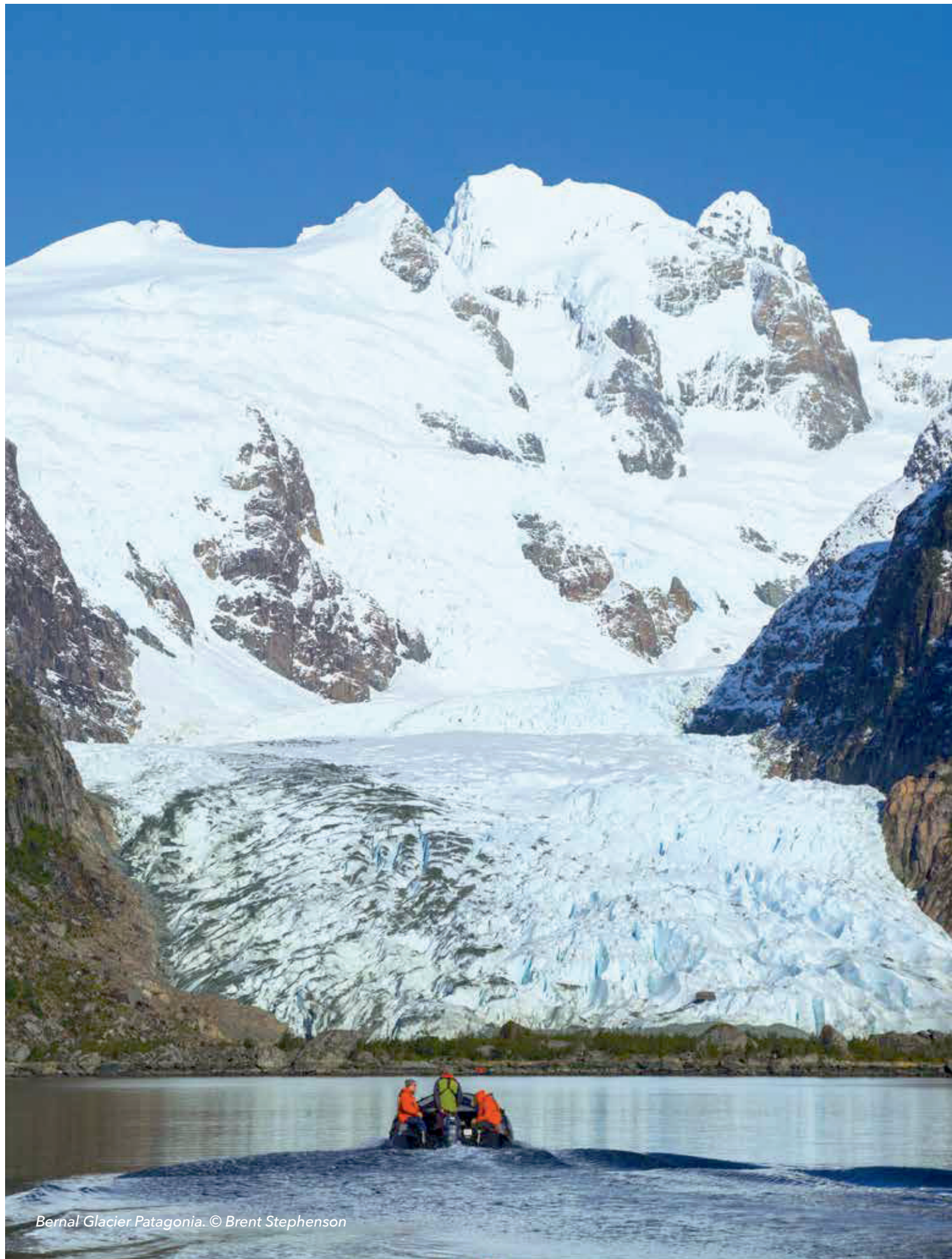
Bernal Glacier Patagonia.