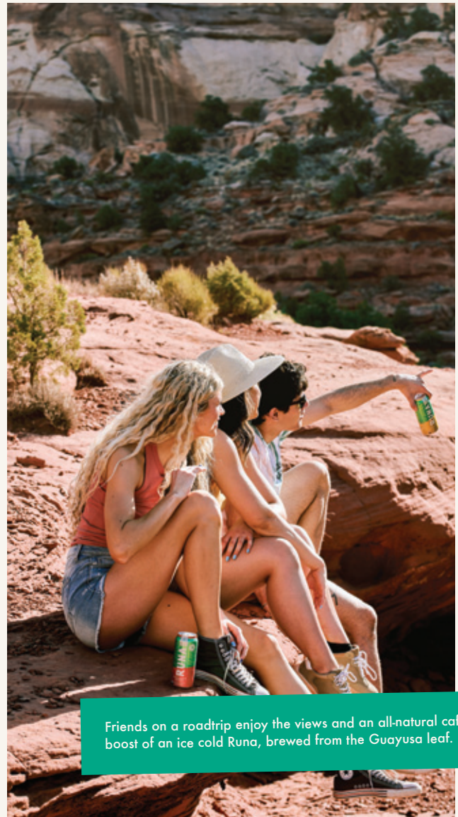
Friends on a roadtrip enjoy the views and an all-natural caffeine boost of an ice cold Runa, brewed from the Guayusa leaf.

Our aim is to ensure we are promoting and investing in a healthy society where wellbeing is prioritized.