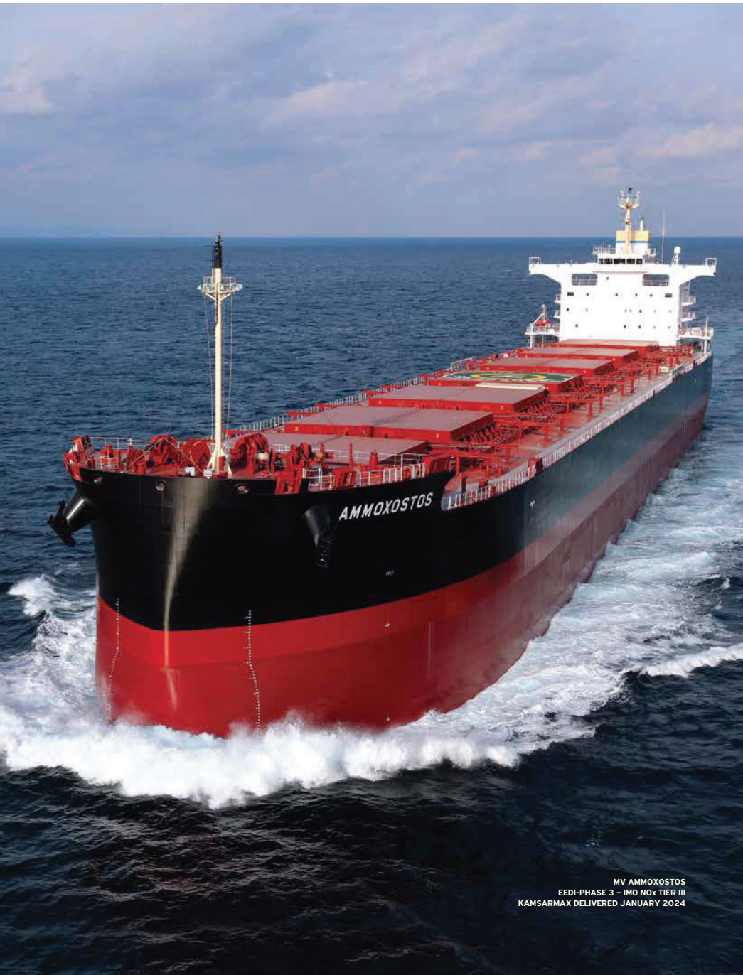
MV AMMOXOSTOS EEDI-PHASE 3 – IMO NOx TIER III KAMSARMAX DELIVERED JANUARY 2024

Safe Bulkers, Inc. is a global shipping company providing worldwide seaborne transportation trade in the dry bulk sector. We are listed in the New York Stock Exchange and our shares trade under the symbol "SB", "SB.PR.C" and "SB.PR.D". We have offices in Monaco, Greece, Cyprus and Switzerland.