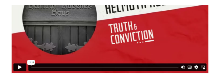
The 20-Year Journey to Create Truth & Conviction