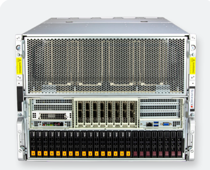
HGX/OAM GPU Systems Generative AI, LLMs and AI Training