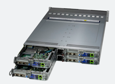
Multi-Node Award Winning Resource Saving Architecture