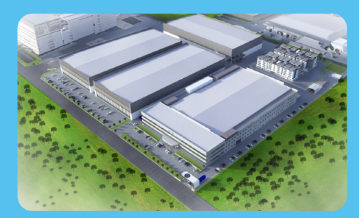
Coming soon! - Malaysia Campus

Worldwide Headquarters Super Micro Computer, Inc. 980 Rock Ave. San Jose, CA 95131, USA Tel: +1-408-503-8000