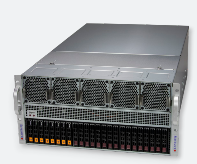
PCIe GPU Systems Al, Media, Omniverse/Metaverse