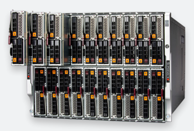
SuperBlade<sup>®</sup> Highest Density and Efficiency for HPC, EDA and Cloud