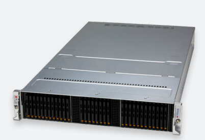
Petascale Storage Maximum Throughput, Lowest Latency