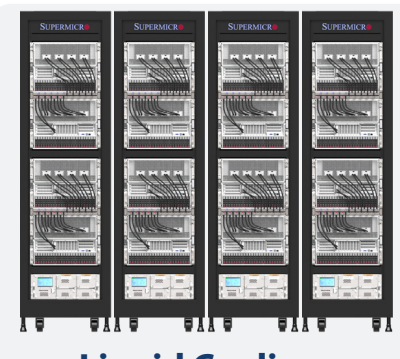
Liquid Cooling Complete Thermal Solutions for Lower TCO