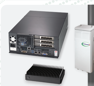
5G Edge Telco, IoT and Smart City