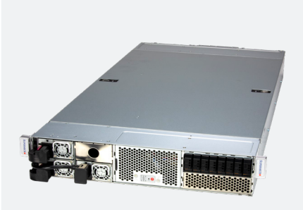
MGX GPU Modular Architecture for Al Infrastructure