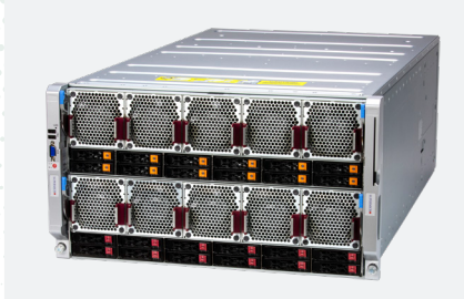
Multi-Processor Compute and Memory Optimized for Enterprise