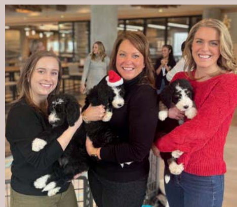
Top: Bridgewater Bank team members gather to celebrate Twin Cities Pride.